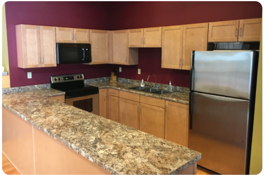
Bunk Room Kitchen