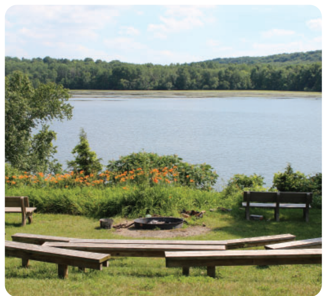
All Camp Fire Scar overlooking Lucas Lake