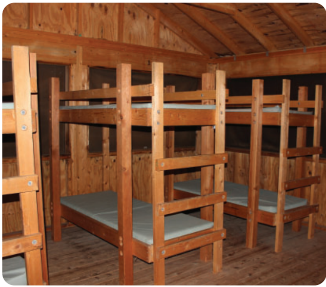
Maple Ridge Cabins