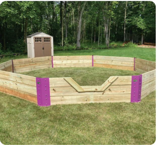
Gaga Ball Pit