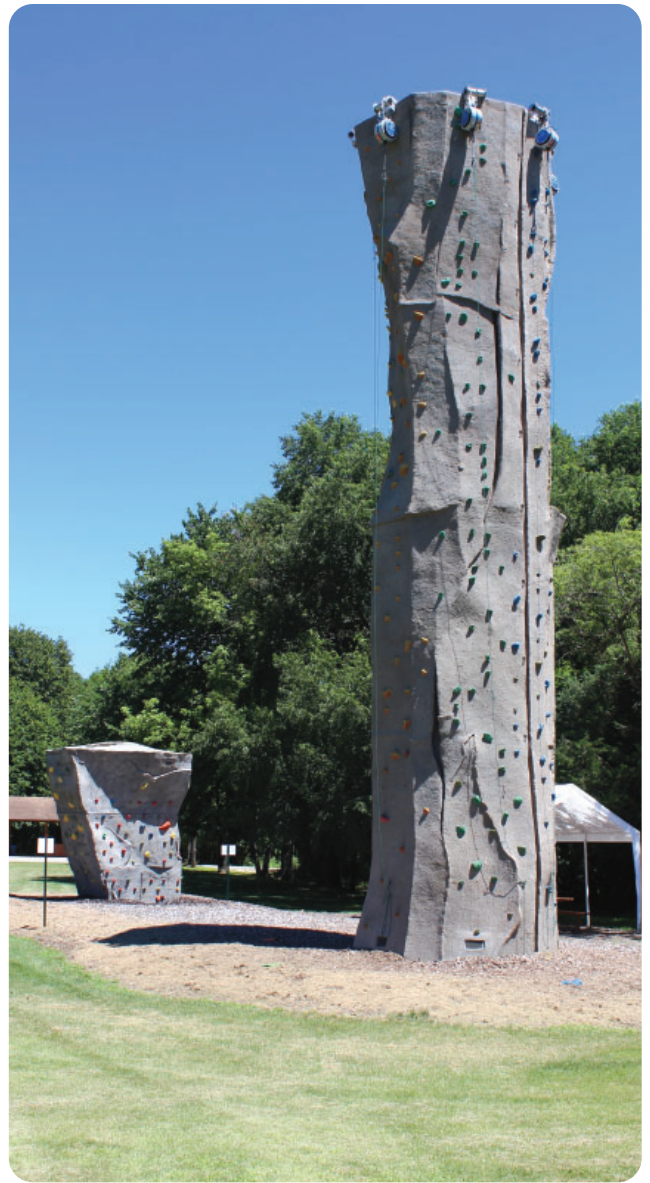
Rock Climbing Walls