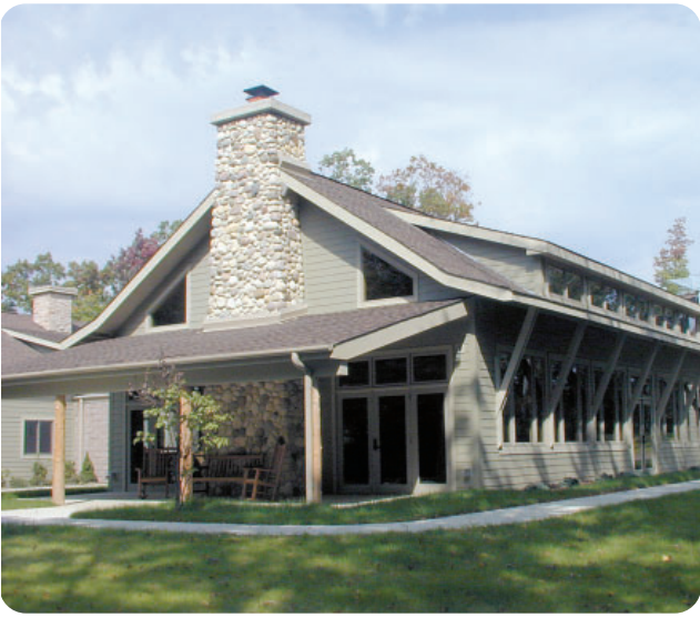
Trefoil Oaks Program Center