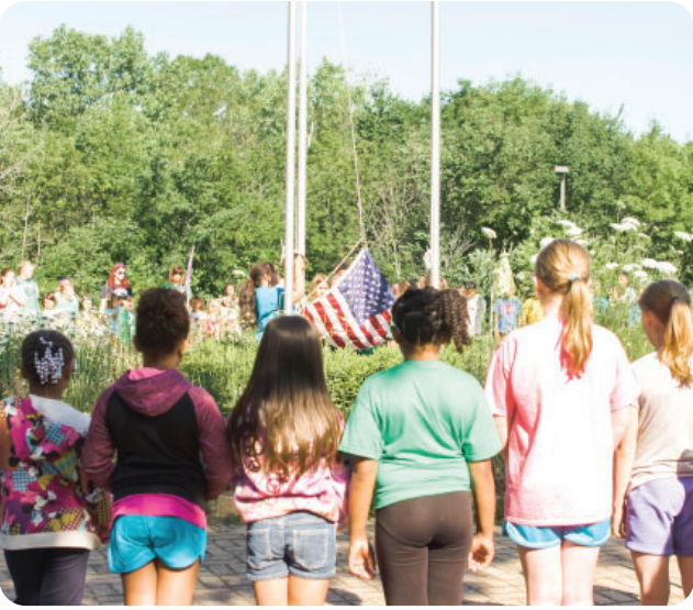
Friendship Circle Flag Ceremony