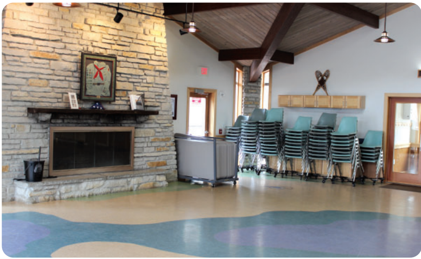
Jo Ann Mann Lodge, Upper Level