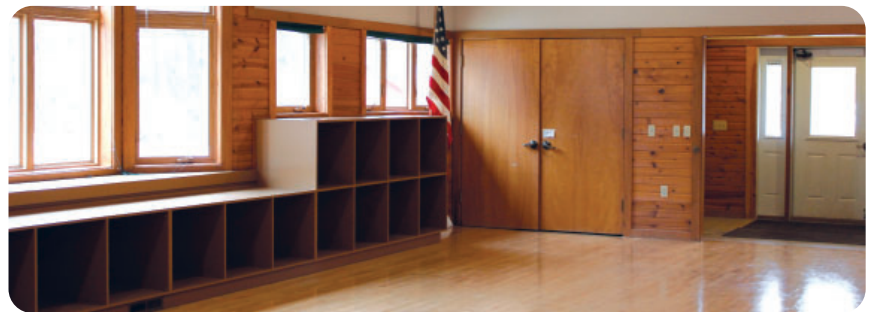
Inside Troop House