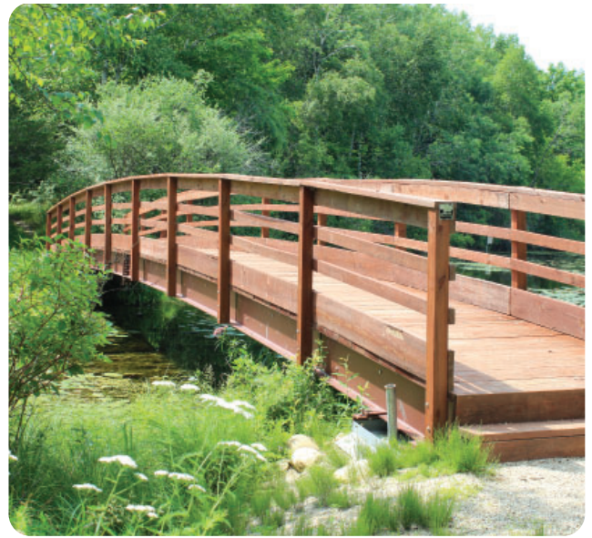
Silver Creek Bridge