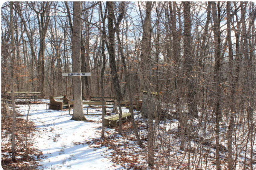
Sleepy Hollow Fire Scar