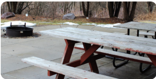
Picnic Area at Troop House

*Only available during the summer or by exception